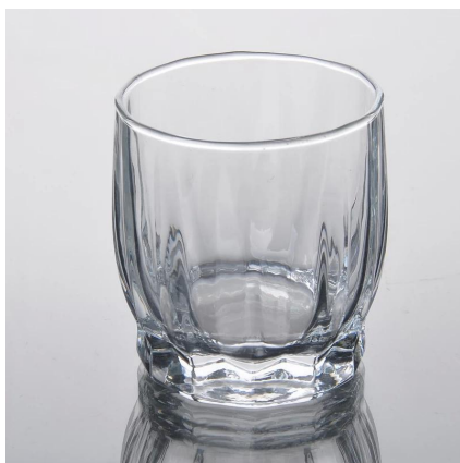
New special design engraving water