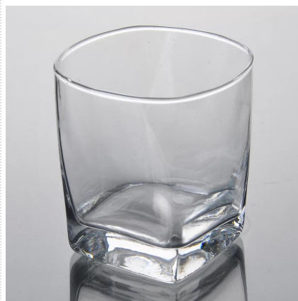
Square bottom drinking glass