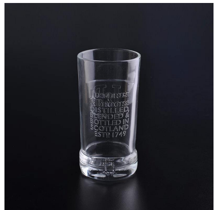
decal printing shot glasses