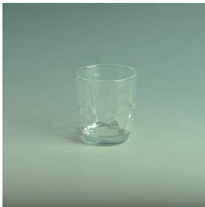
small shot glasses