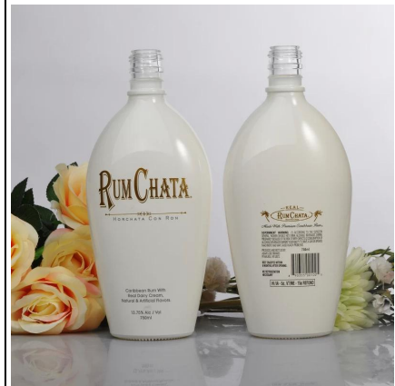
Bottle of high quality vodka with white paint