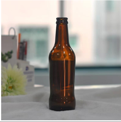
Amber glass bottle of whiskey