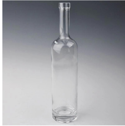
750ml clear glass bottle of vodka