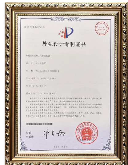
Patent n. 2.201630655323.4