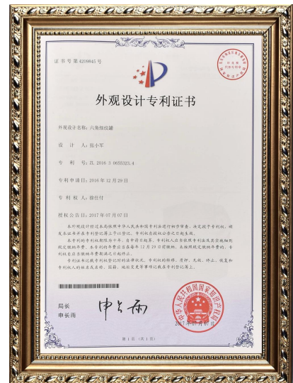
Patent n. 2.20163065523.4