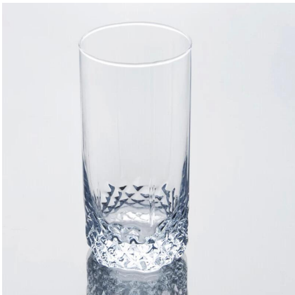
highball glass cup