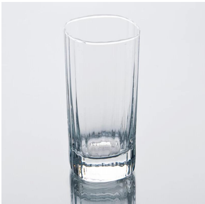
11 oz highball glass