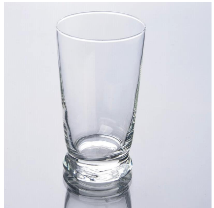
highball glass drinking cup