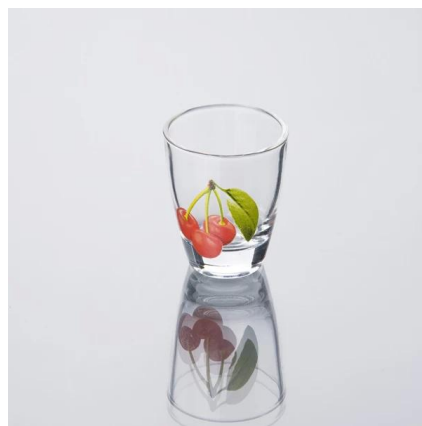
printing shot glass