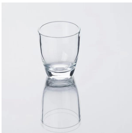
shaped shot glass