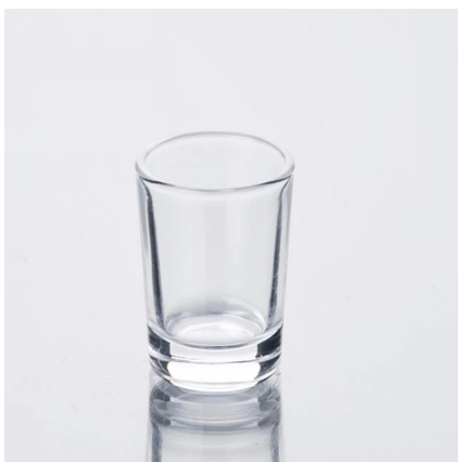
clear mini shot glass