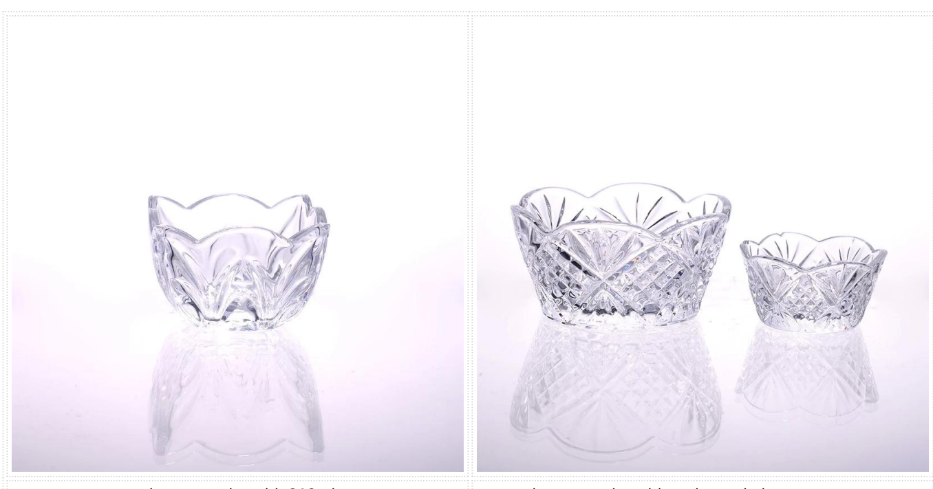
glass sugar jar with 212ml