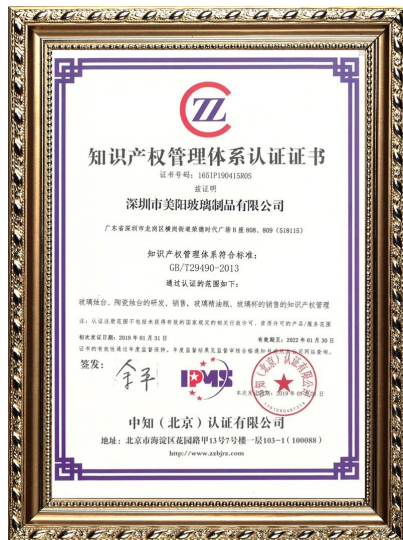
Enterprise Intellectual Property Patent No.:201630655323.4