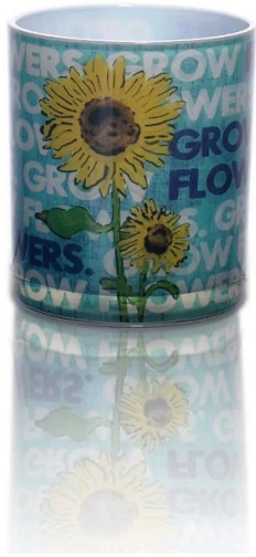
Sprinkle colored crystal chandelier