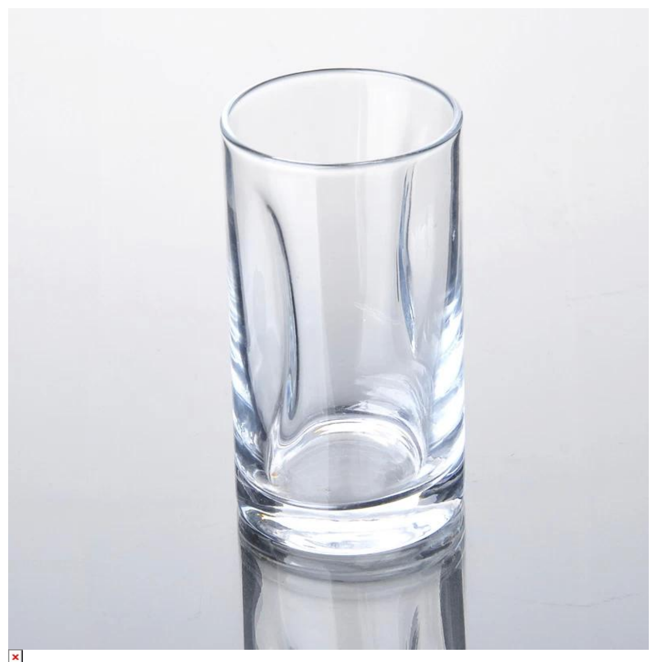
× Related Products: