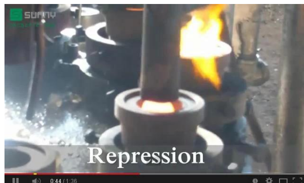
Mechanical press technology