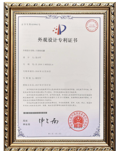
Patent Number: 201630655323.4