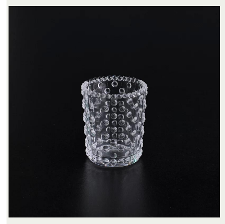
glass candle holders