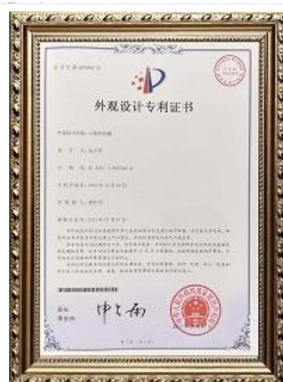
Patent no.: 201630655323.4