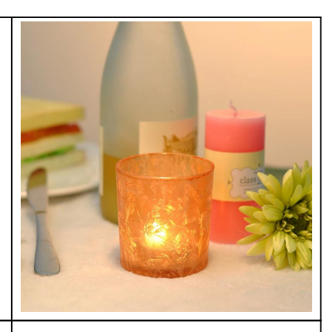
Frosted Glass Votive Candle Holders