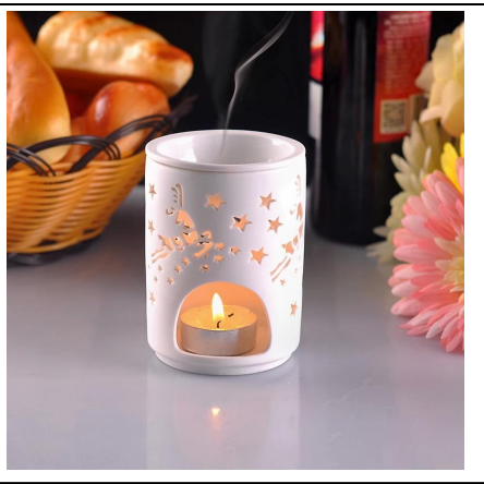
hollow design ceramic vigil lamp candle holder