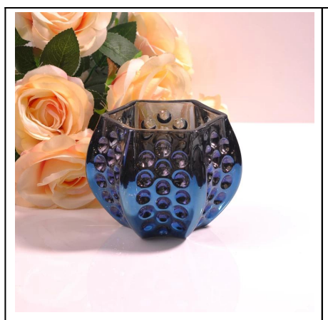
high quality wedding candle holder