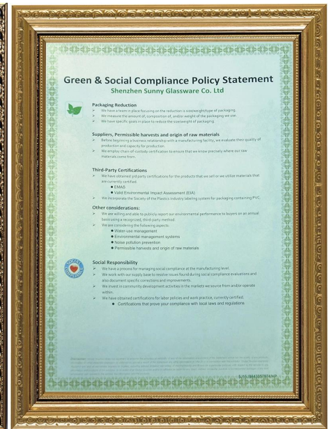
Green and social responsibility Policy's statement