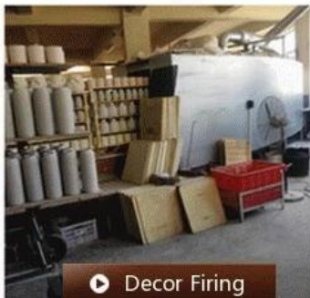
▶ Decor Firing