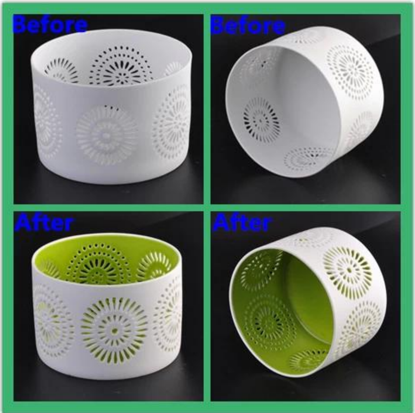
More White Marble Ceramic Candles Holders