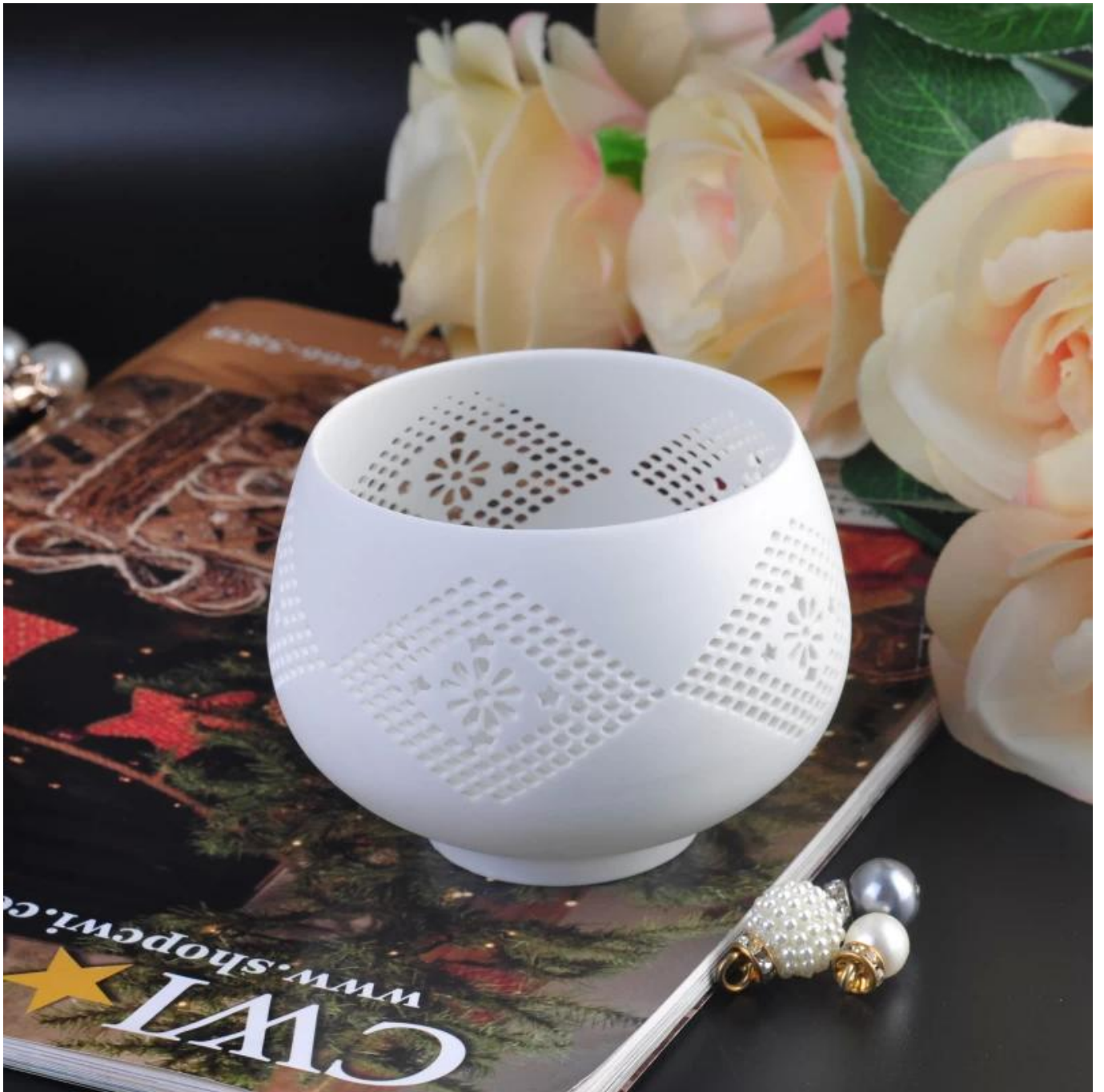
Custom Design Is Available As Below Examples