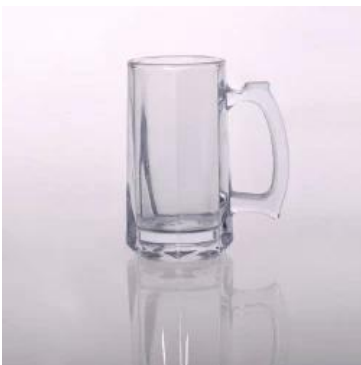
Machine made 360ml large beer glass mug