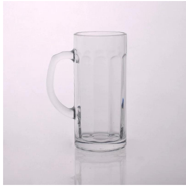
14oz glass beer mug