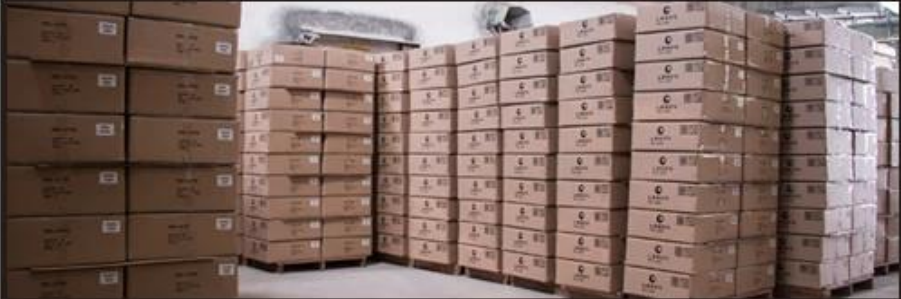
Packing Ready to loading