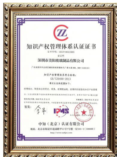
Enterprise intellectual property