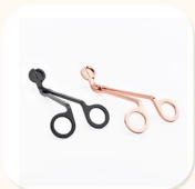
Wick Trimmer Cutter