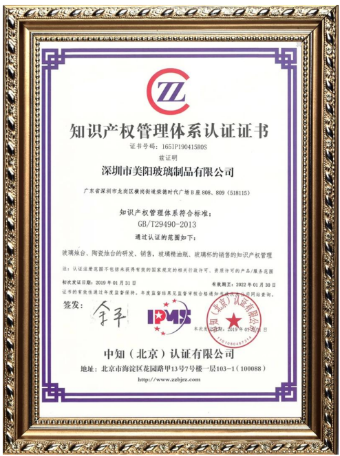
Enterprise intellectual property