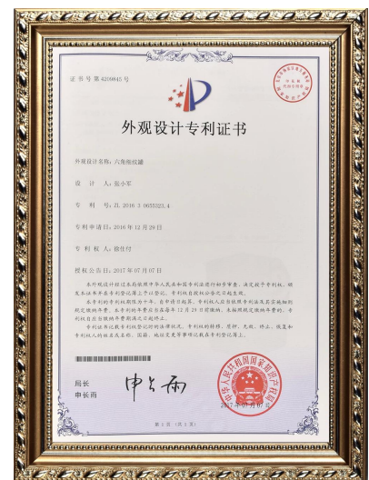
Patent number: 201630655323.4