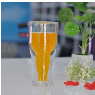
Double wall glass bouble wall beer glass