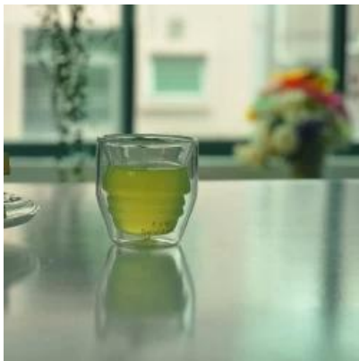
Pyrex coffee cup