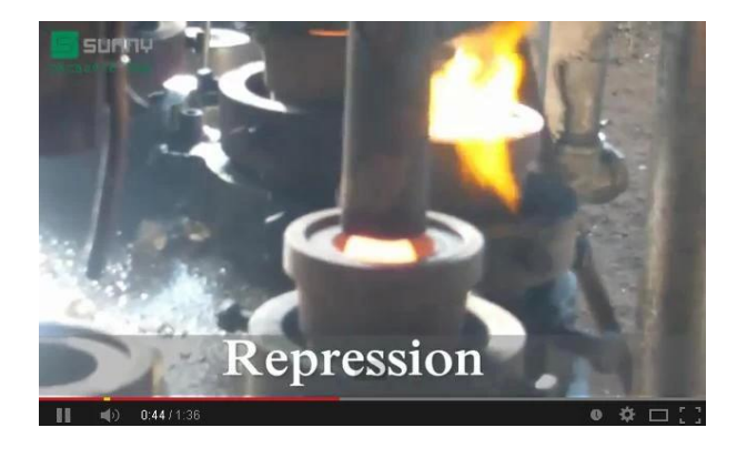
Mechanical press technology