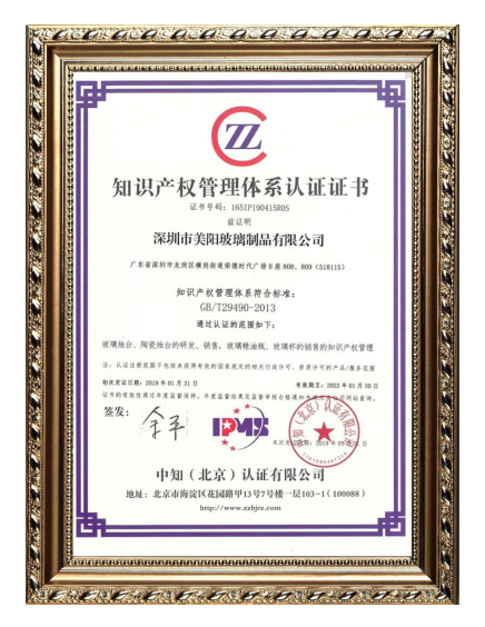
Corporate intellectual property

Sunny Glassware has passed the ISO 90012008/2015 quality management system certification and implemented corporate intellectual property standards to protect the interests of its customers.