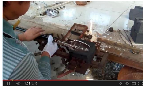
IS machine technology