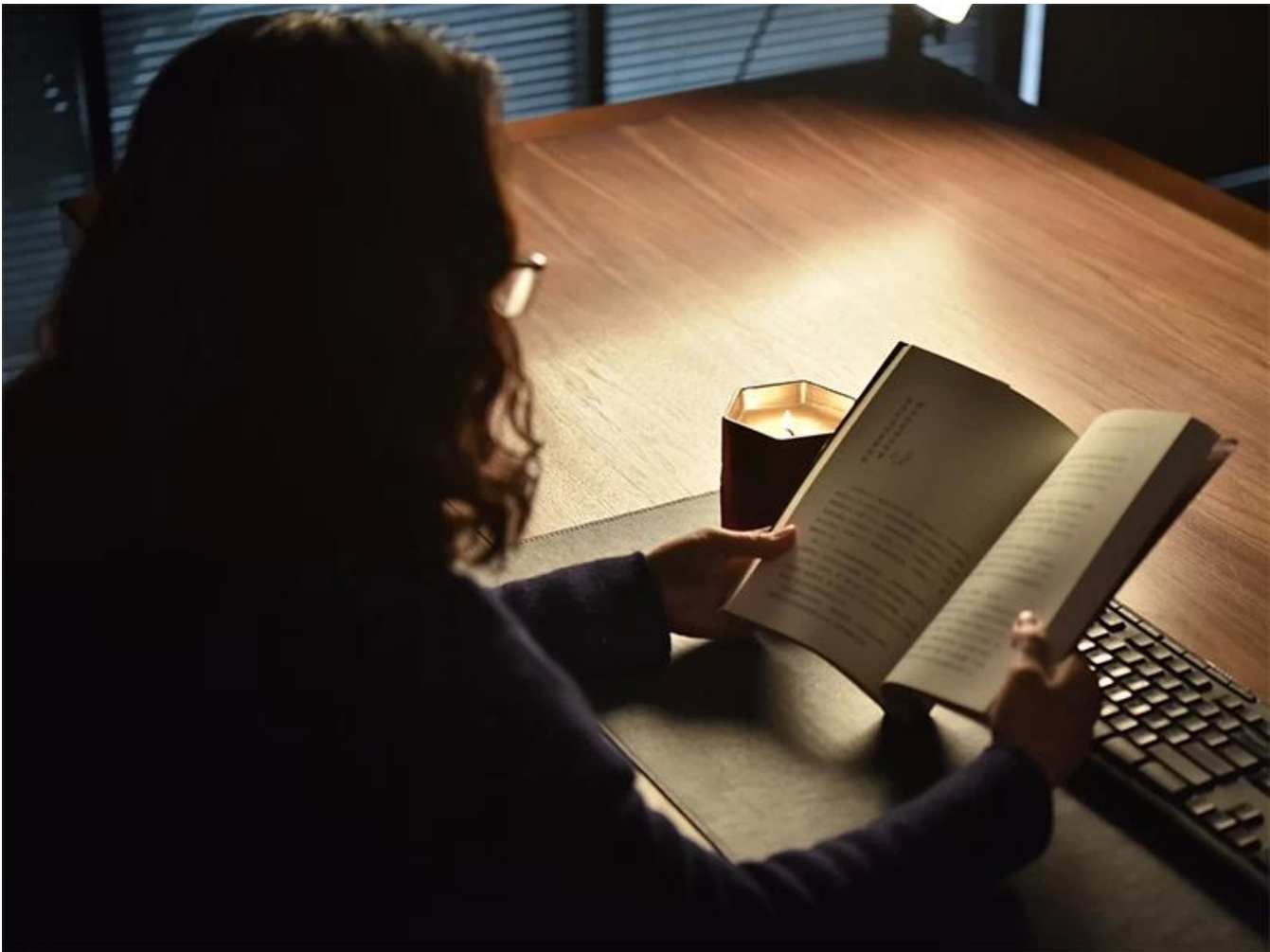
Sunny Brand Story