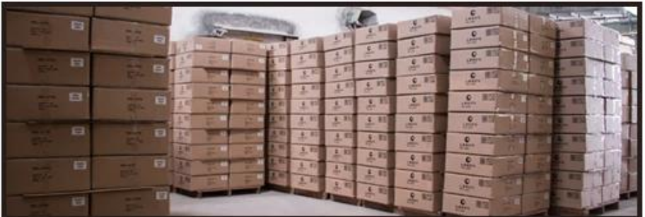
Ready to loading