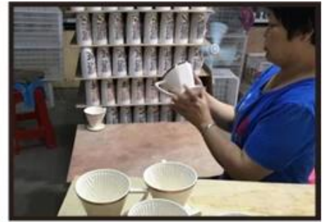
Inspection the decal product