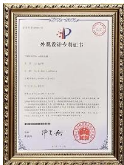
Patent no.: 201630655323.4