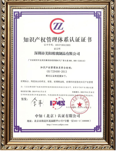
Corporate intellectual property