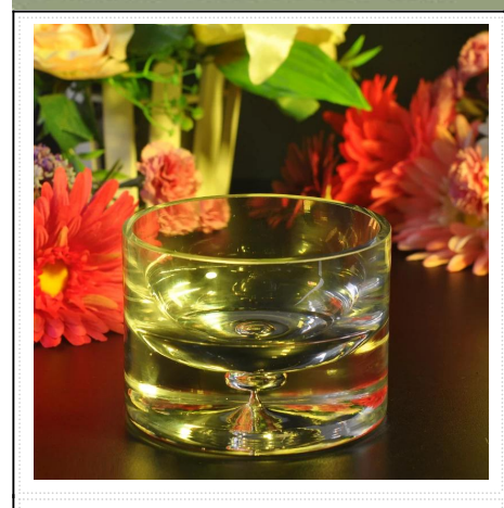
candle holder glass water drop