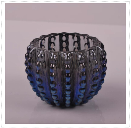
glass stripe dot candle holders