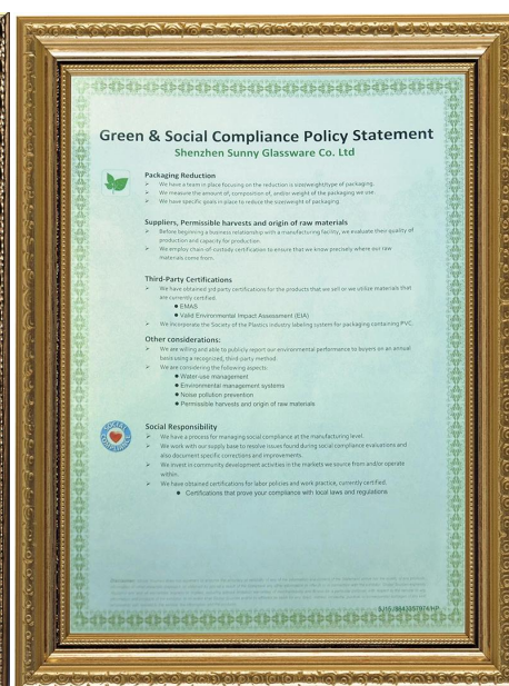
Green and social responsibility Policy's statement