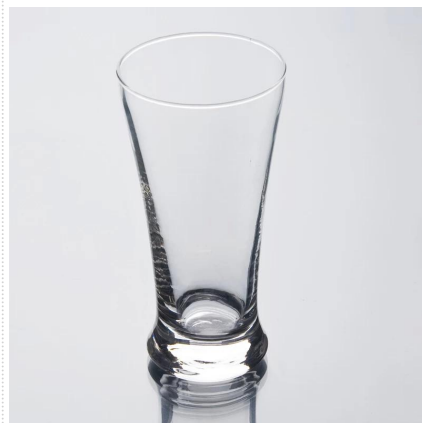
machine blown glass tumbler