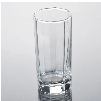
11.3oz machine blown glass cup