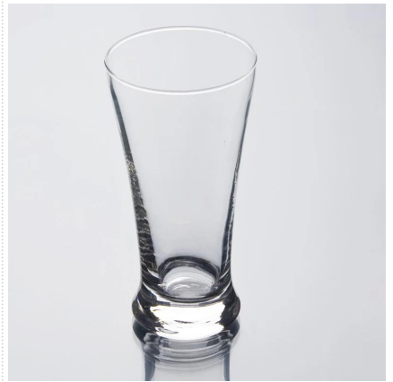
machine blown glass tumbler