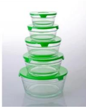
heart shaped glass bowl with color lid