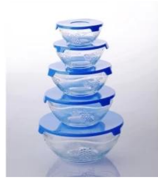
round dinnerware sealed glass bowl