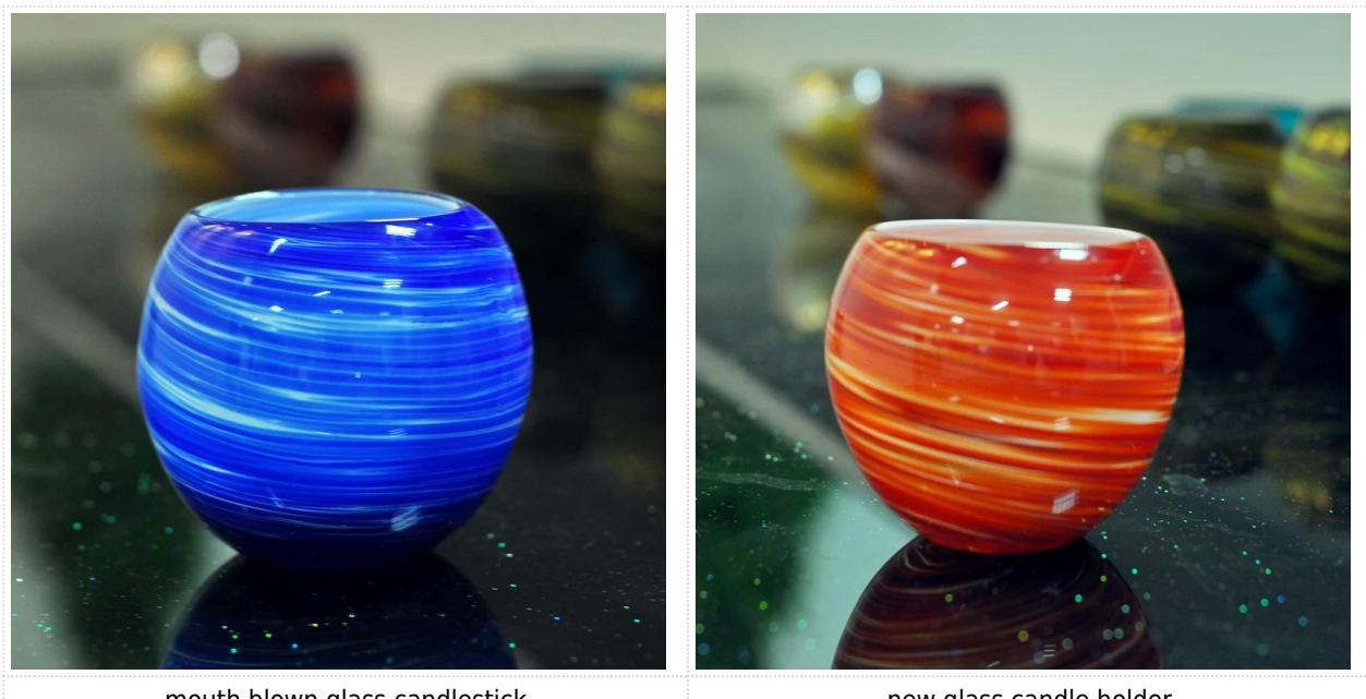
mouth blown glass candlestick