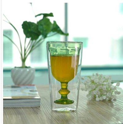
Borosilicate double wall drinking glass