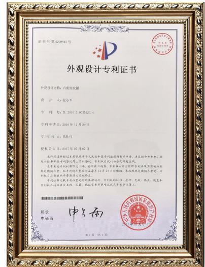
Patent number: 20163065532.4