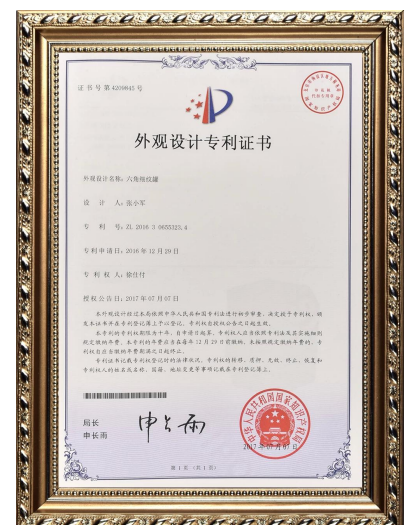
Patent No.: 201630655323.4