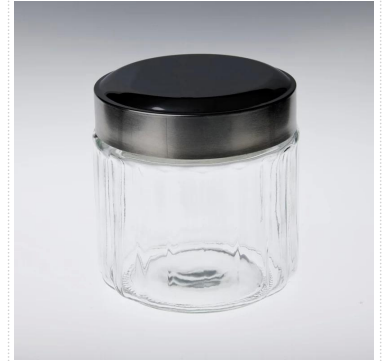
candy jar glass