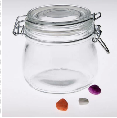
customized glass storage