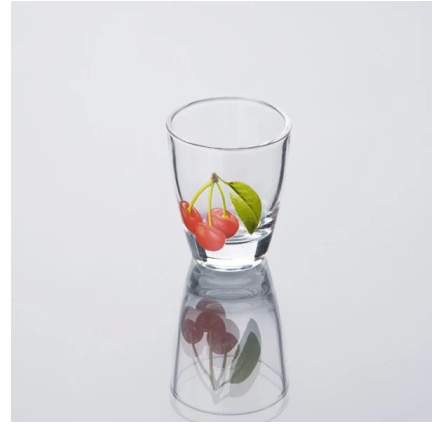
printing shot glass