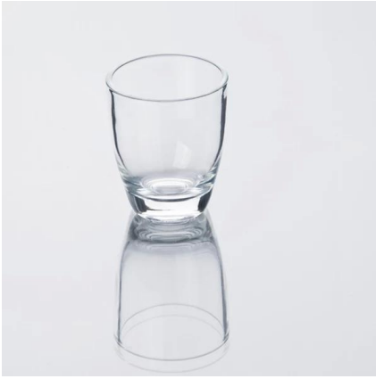
shaped shot glass