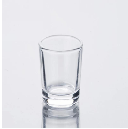
clear mini shot glass