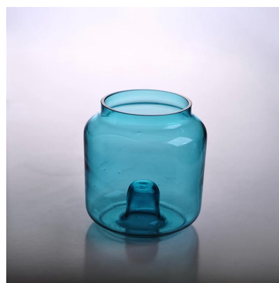
New arrival handmade glass candle holder