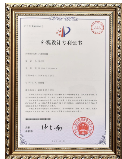
Patent Number: 201630655323.4