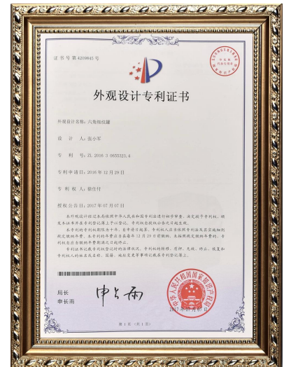
Patent Number: 201630655323.4