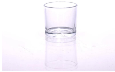
machine made glass candle holder