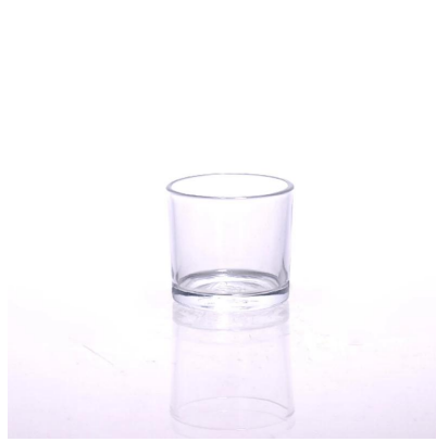
machine made glass candle holder