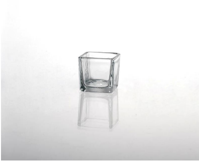
square clear glass candle holder