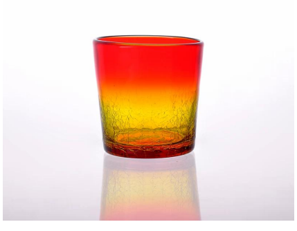
glass candle holders