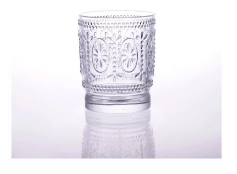
pattern glass candle holder