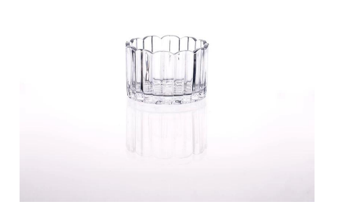
clear candlestick glass