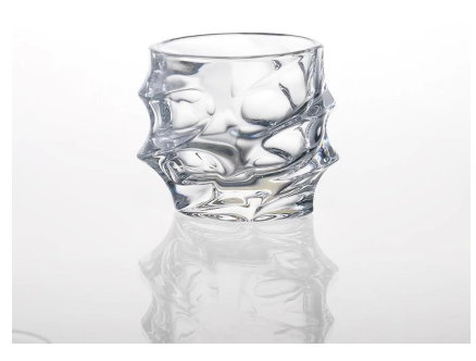
decoration glass candle holder