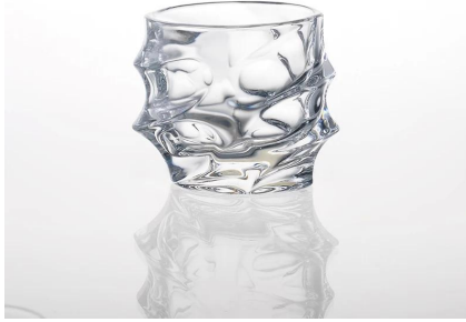
decoration glass candle holder