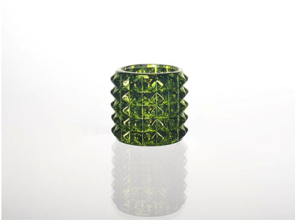
colored glass candle cup