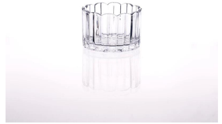
clear candlestick glass