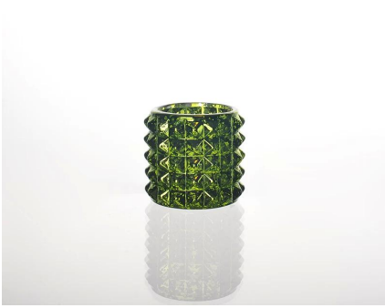
colored glass candle cup