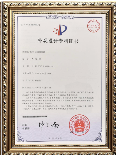
Patent no.: 20163065323.4