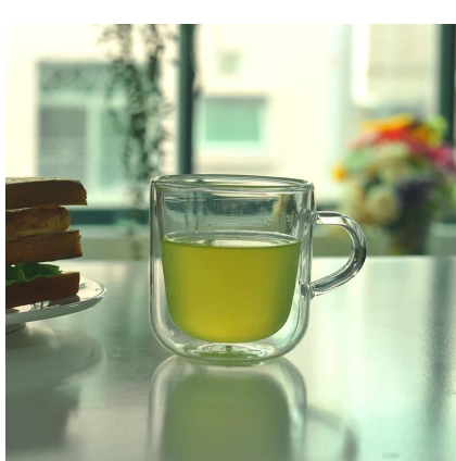
200ml double wall tea cup supplier in China