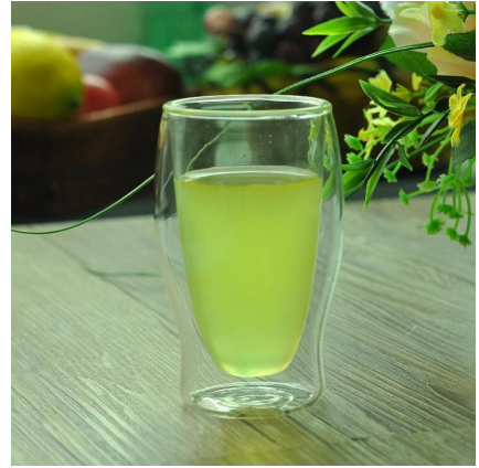
150ml 250ml 350ml 450ml borosilicate double wall drinking tumbler