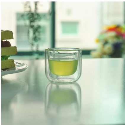
cylinder shape clear double wall borosilicate tumbler