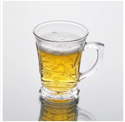
wholesale glass mug