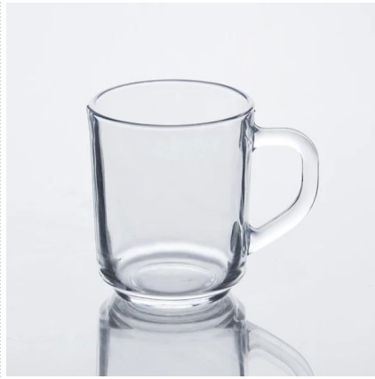
clear water glass mug