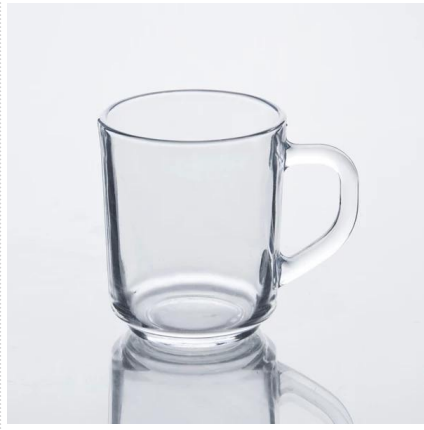
clear water glass mug